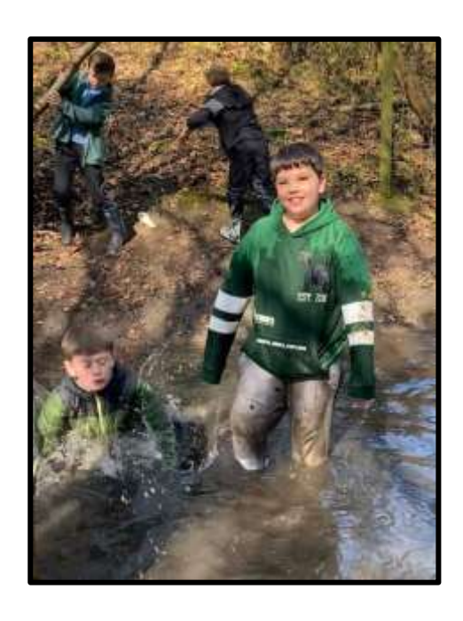
Others accidentally went for a swim!